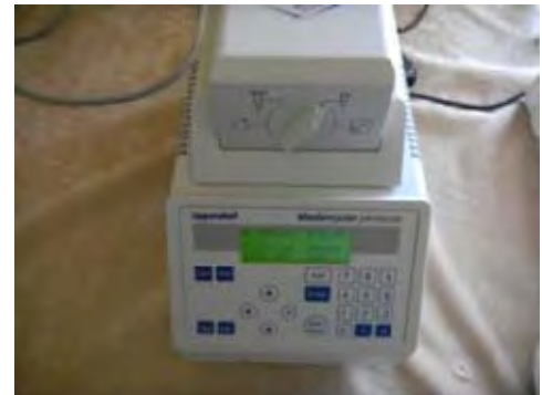
Polymerase chain reaction (PCR)