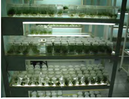
TC Culture rooms