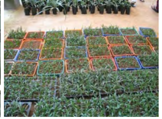
TC Plants hardening