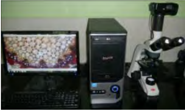
Microscope with camera

Pineapple Research Station has well equipped laboratories in biotechnology, microbiology and phytochemistry. The major items of equipment and facilities include the following in line with a world class research centre.