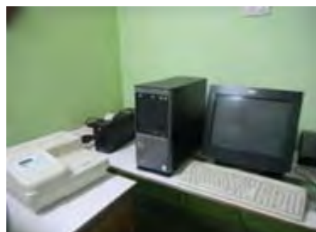
Gel doc with imaging system