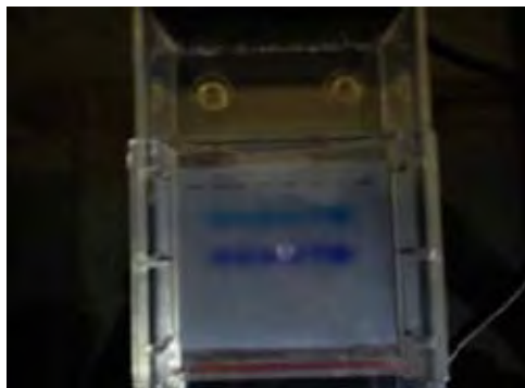
Agarose gel electrophoresis (AGE)