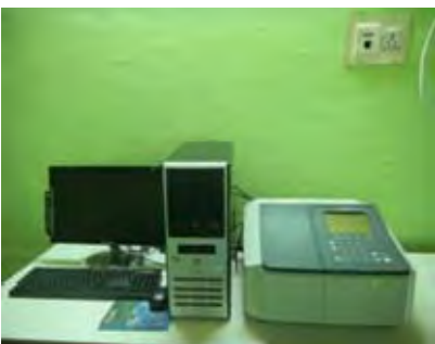
UV visible spectrophotometer