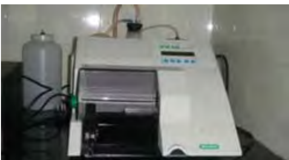
ELISA reader and washer