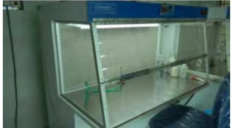
Laminar air flow chamber