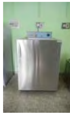
Hot Air ovens