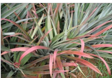
PMWA virus infected pineapple