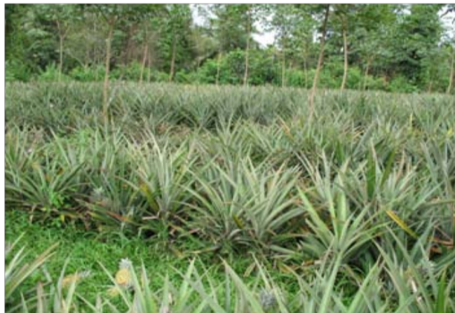
Pineapple intercropping in rubber plantation