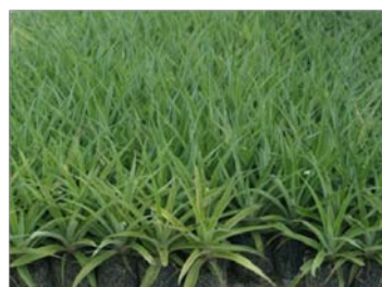
Pineapple TC plants