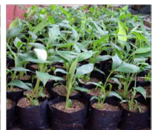
Banana TC plants