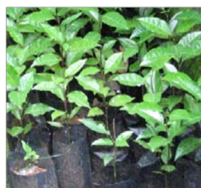
Passion fruit seedlings