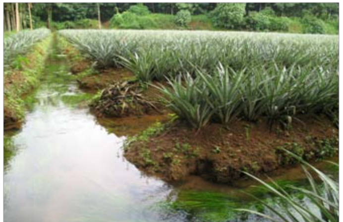
Pineapple in reclaimed paddy lands