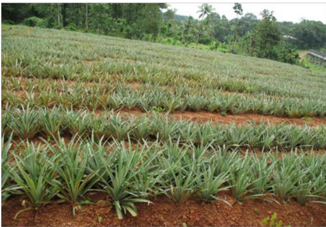
Pineapple pure cropping