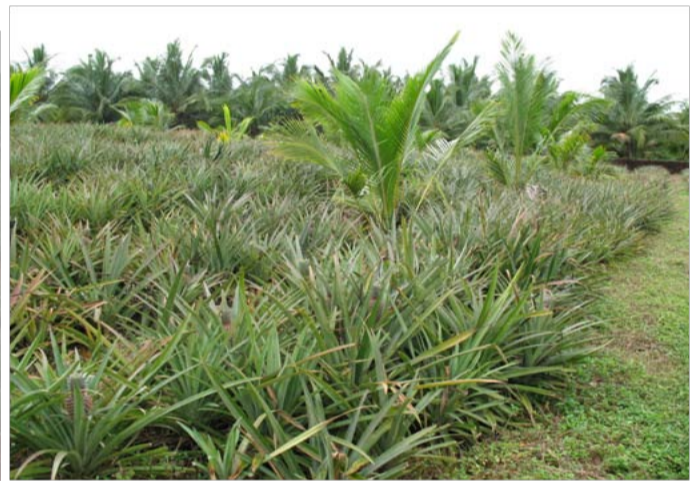
Pineapple intercropping in coconut plantation